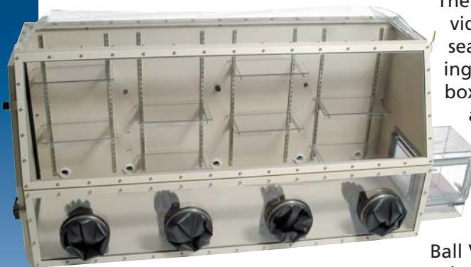
ALUMINUM GLOVE BOX

The door gaskets provide a safe positive seal without interfering with full access to the glove box interior. The viewing slope allows the user an uninterrupted view of the work in progress. Gloves are easily exchanged/ replaced in a matter of minutes. Pressure Relief Valves and Manual Inlet Ball Valves make it easy to purge in a desired gas mix for oxygen or moisture control.