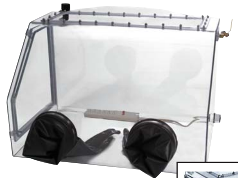
POLYMER GLOVE BOX

All Basic COY Glove Boxes are fabricated to meet rigorous standards for cleanliness and durability. Solvent welding ensures an air-tight structure that won't leak.